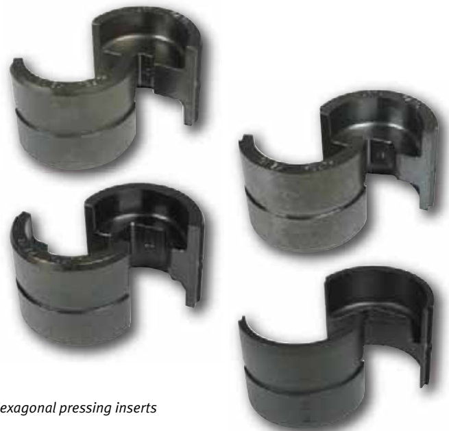
Hexagonal pressing inserts