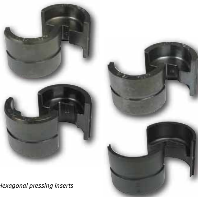
Hexagonal pressing inserts