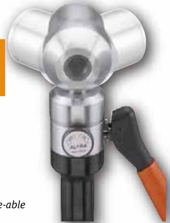
Prod.-No. 02050/02055 90° angled and 360° rotate-able

Extended tool life owing to a built-in pressure control valve. "Automatic pressure switch off at 650 bar"