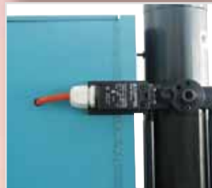
Electric safety locking for accident prevention.