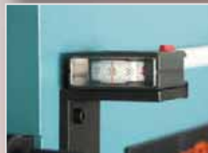
Measuring tape indicator for Y axis