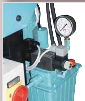
Two-circuit hydraulic unit