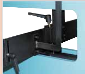
Stop system movable in Y-direction, 2 guiding shafts in pressing body.