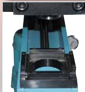
Die seat holder